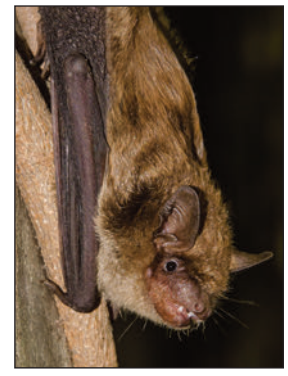
Big Brown Bat

All Illinois bats are protected under the Wildlife Code (520 ILCS 5/1.1). Bats may not be shot, trapped, transported, or held in confinement except when a bat is found in an area where they may have contact with humans or domestic pets.