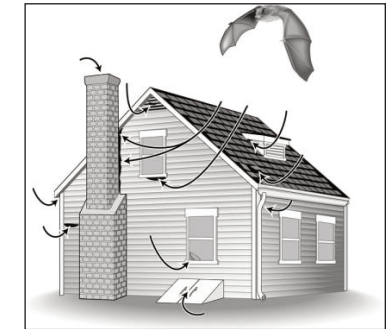
Potential bat entry points.

Some skill is required to identify all potential entry points and to apply exclusion materials to openings. Openings through which bats are entering and exiting a structure may be identified from inside the structure by entering the roosting area, an attic for example, on a sunny day when light can be seen through the openings. Another method is to turn on a bright light in the attic at night and look for light escaping through the openings on the building's exterior. Dark stains may be seen around and beneath openings used by bats.